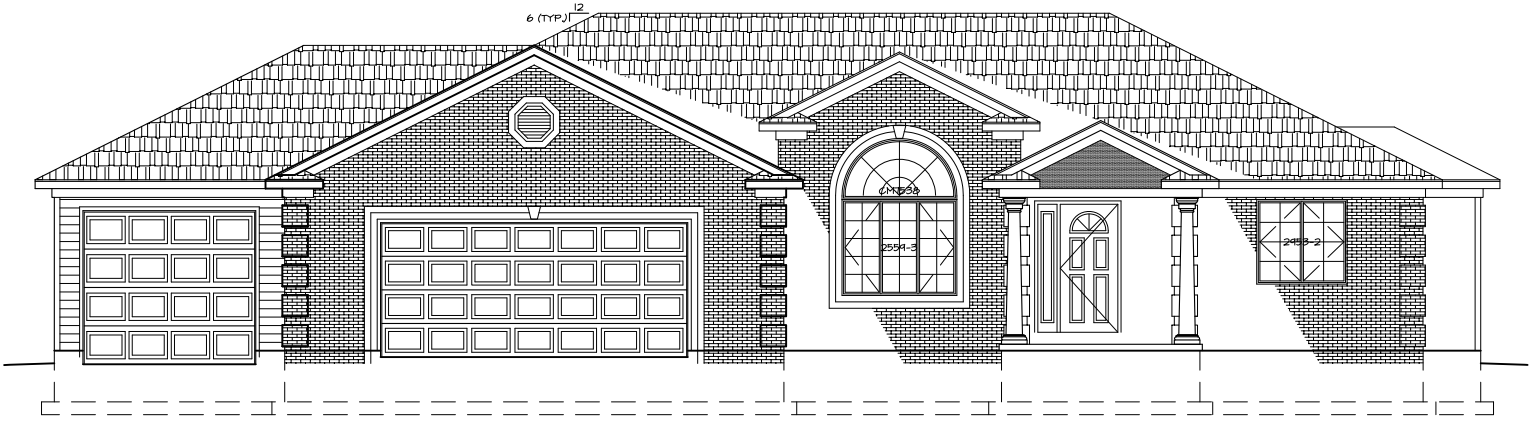
1 FRONT ELEVATION A-1